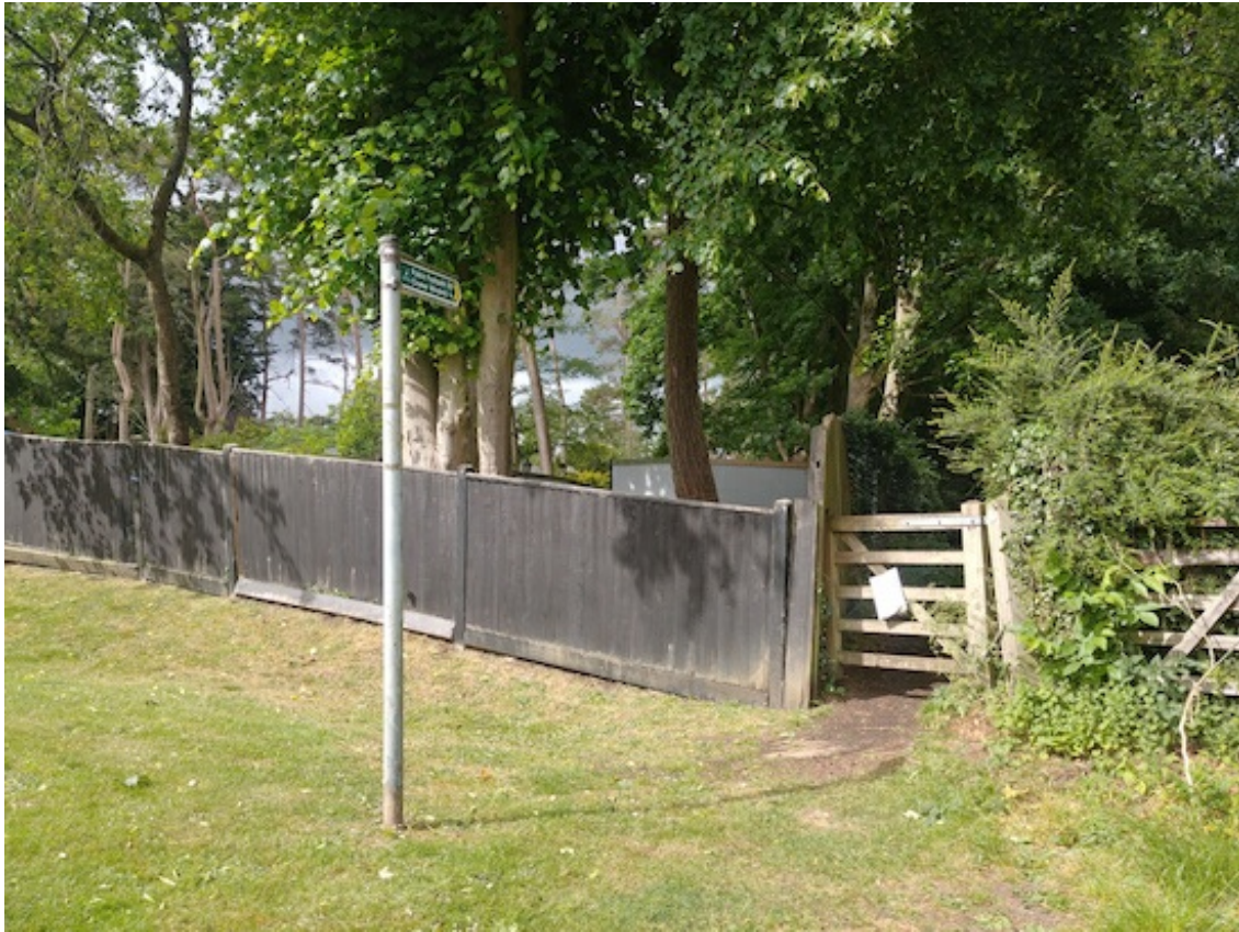
The footpath at the start of the walk, mentioned in point 1 above

2: Shortly after a wooden bridge take the footpath on your right, still Cottered footpath 26. There is a bench here by the marker. Head SW across the fields heading for the windmill in the distance.