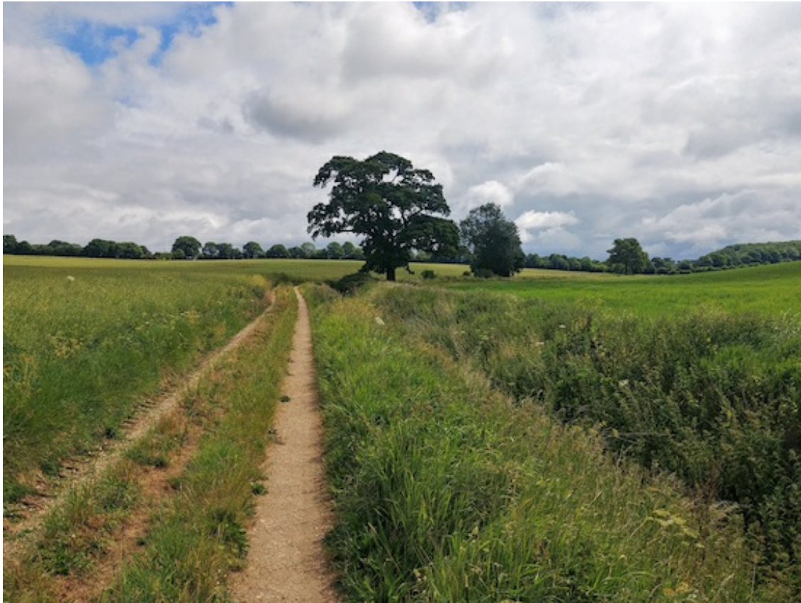
The oak tree on Ardeley footpath 36 mentioned in point 8 below

8: After 460m and at a point just past an oak tree, there is a marker pointing left across the fields. We intended to take this path, but on the day we walked this route the path had been covered by crops and we decided not to damage what was growing, but, instead to continue heading E along the track before following it as it bends left and uphill heading N before bending to the right and meeting Ardeley BOAT (byway open to