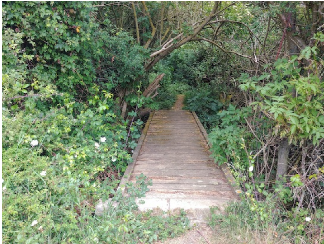
The footpath and footbridge leading to the woods, mentioned in point 12 above

13: Turn right on this path, cross the footbridge and walk diagonally NW through the woods until you reach a wooden bridge leading to an open field.