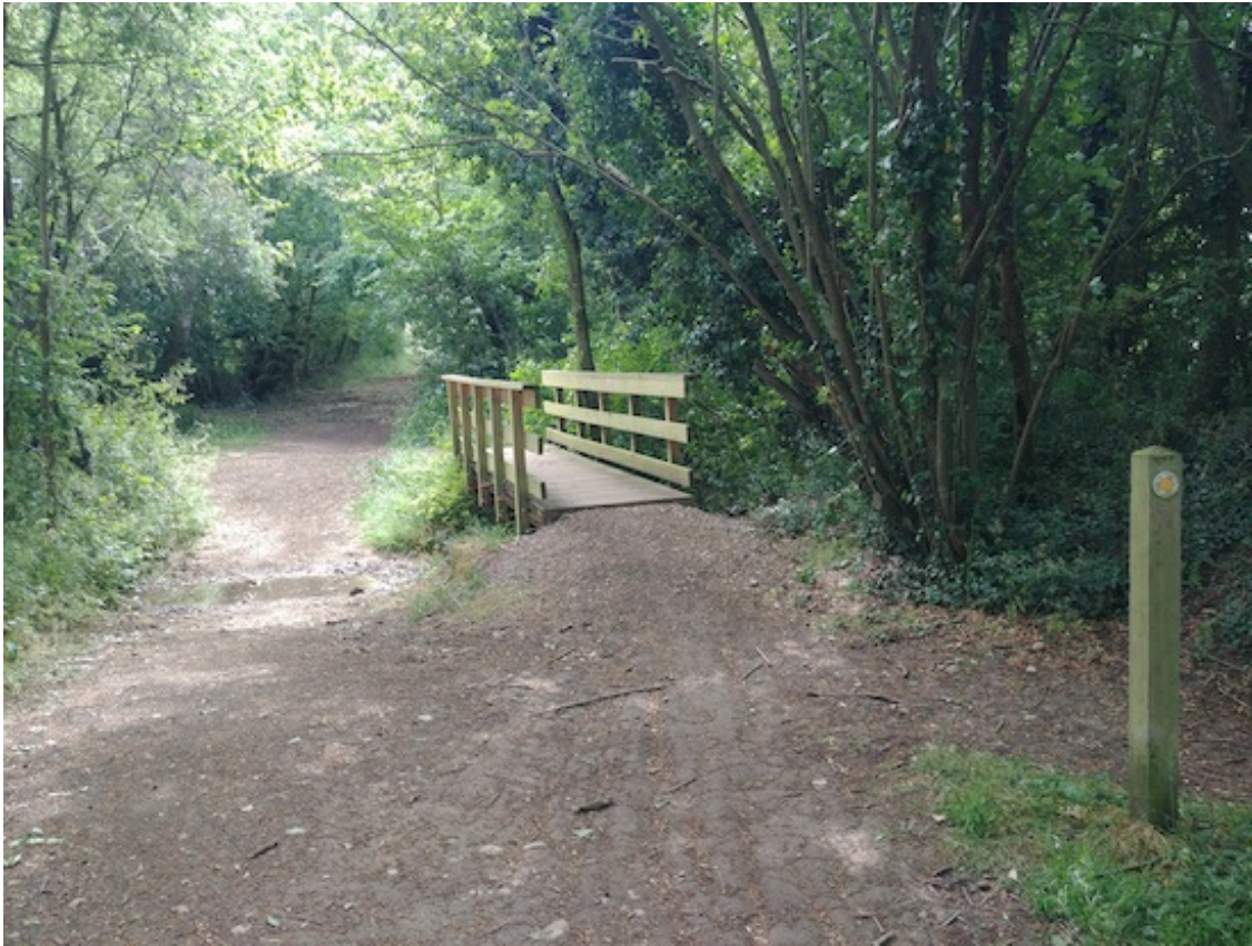
The second ford and a footbridge on Ardeley BOAT 10 mentioned in point 10 below

10: After crossing the second ford, pictured above, turn left and take Cottered BOAT 47 and follow it NE for 780m to the point where the BOAT bends to the left and you reach a footpath, Cottered footpath 29, heading off to the right.