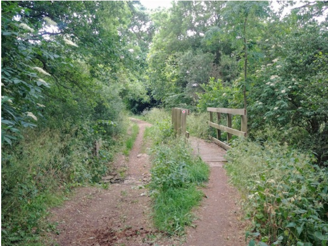
A ford and a footbridge on Ardeley BOAT 10 mentioned in point 9 above