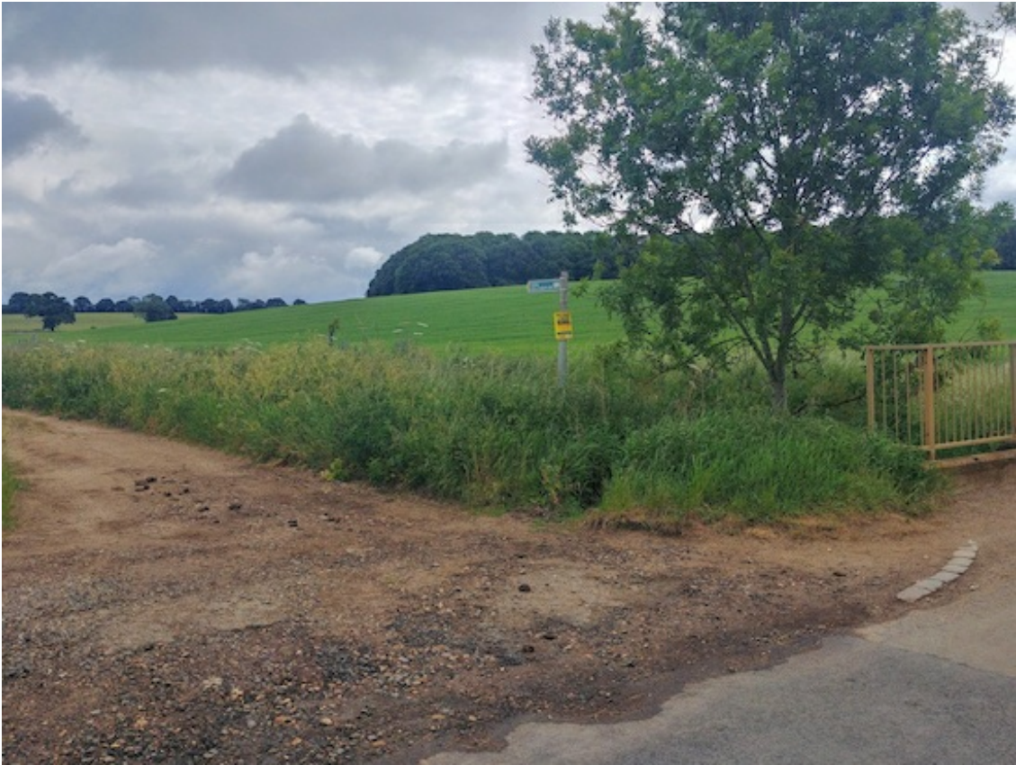
Ardeley footpath 36 and the bridge mentioned in point 6 above

7: Turn left on this path and follow it NE along the N side of Ardeley Brook.