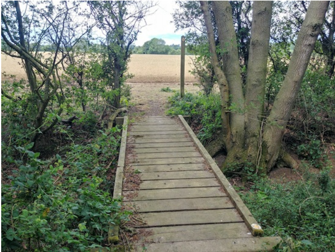
The footbridge leading to the open field, mentioned in point 13 above

14: At this point your way is straight ahead, indicated by signs on the bridge and on a marker, but when we walked this the field had recently been ploughed and the path wasn't clear. Using our Ordnance Survey mobile app we were able to use GPS to follow the path W across the field for 260m to the hedgerow on the opposite side. For those without an app you should be heading for a gap in the hedge to the left of a tree